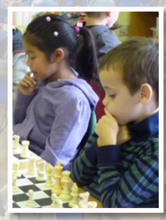
DEEP IN THOUGHT: Some of our youngest players at our Under-8 championships

SO PROUD: The U11 girls - EPSCA champions, 2012