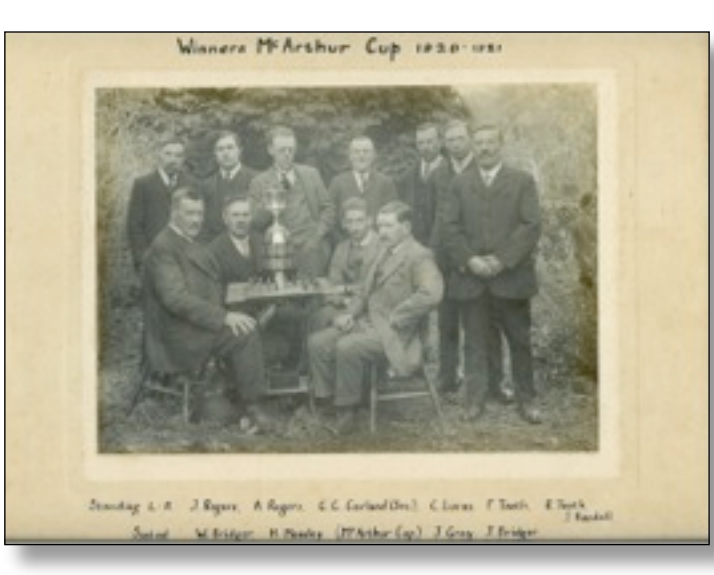
McARTHUR MAGIC: The victorious Lodsworth village chess team, which beat Hastings in 1921, a magnificent achievement

11.c4 dxe4 12.Nxe4 Nxe4 13.Bxe4 Qh4 14.Qe2 Re8 15.f4 Nd7 16.Bb2 Nc5 17.g3 Qd8 18.fxe5 Na4 19.Rad1 Qg5 20.Bd4 Bh3 21.Rf4 Rad8 22.Bd5 Be6 23.Rdf1 Re7 24.Qf3 b6 25.h4 Qg6 26.h5 Qxc2 27.Rf2 Qb1+ 28.Kh2 Nc5 29.Bxc5 bxc5 30.Bxe6 Rxe6 31.Rxf7 Rxe5 32.Rxg7+ Kh8 33.Rg6 1-0