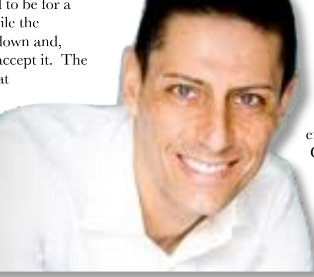
CENTRE OF ATTENTION: ECF president CJ de Mooi

limited to club, league and county matches, the basic ("Bronze") level of membership will suffice. This will cost \pounds 13 per annum for adults (with a \pounds 1 reduction