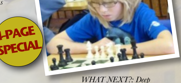
WHAT NEXT?: Deep concentration at the Sussex Megafinal of the UK Chess Challenge, also pictured on the front cover

ALL SMILES: The U13 team - ECF national champions 2012