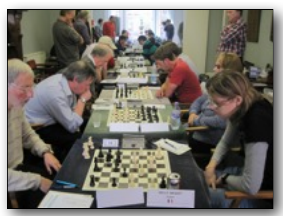
FRENCH CONNECTION...action from Brighton's 15-board home match v Dieppe

Along with the club website, we have an internet presence on Chess.com where matches against Hastings & St Leonard's and